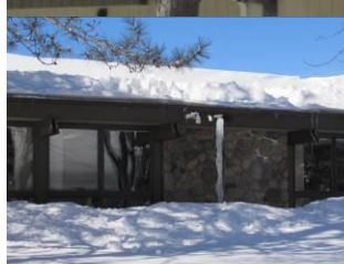
One Third Finished!